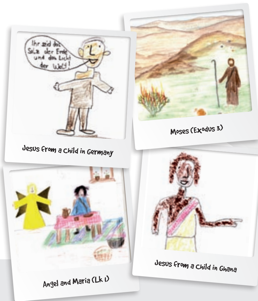
Jesus from a Child in Germany